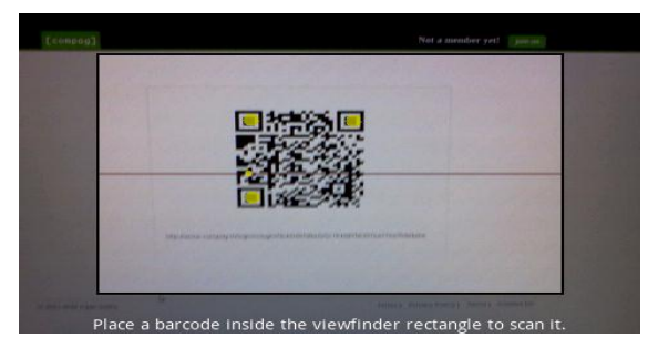
Figure 2: Scanning QR code generated on webpage.

Proceedings of the NCNTE-2012, Third Biennial National Conference on Nascent Technologies Fr. C. Rodrigues Institute of Technology, Vashi, Navi Mumbai. Department of Computer Engineering & Information Technology